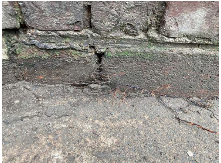
DRside_DrainagePlane_2101.JPG Mortar detail